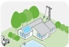
Residential backup power